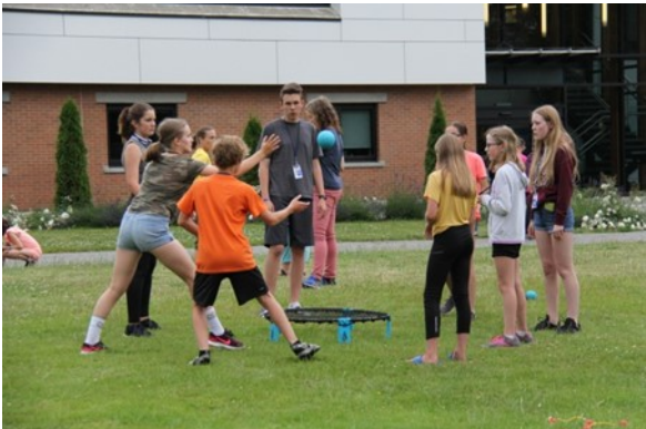
There were games