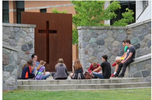
There were small group Bible studies