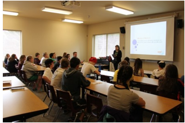
There were breakout sessions

The eleventh LCC NYG was in Langley, BC, from July 5-9. There were fourteen youth and their friends from Foothills accompanied by five adults, and the group was joined by five youth from two different churches with no youth leader. You can read more about the NYG in the July/August issue of the Canadian Lutheran. Thank you to everyone from Foothills who supported the trip! The next gathering will be the IMPACT Gathering (formerly the ABC DYG) in BC in July 2020, and the next NYG will probably be the Central Region in July 2021.