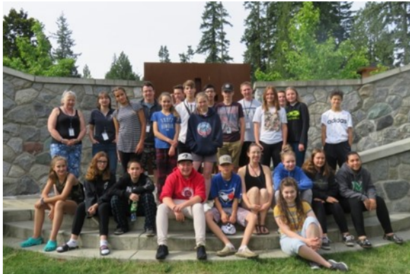
The whole group!