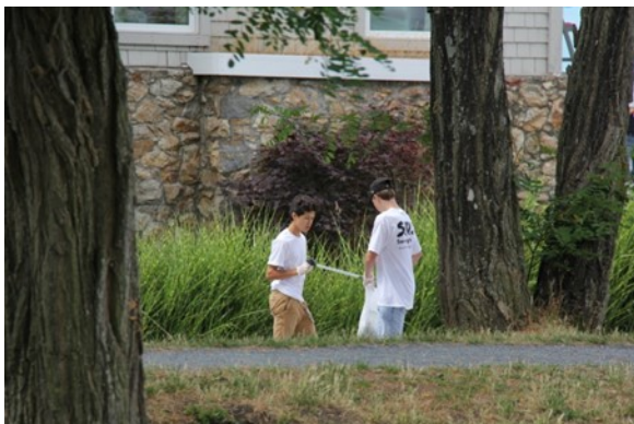
There was a servant event