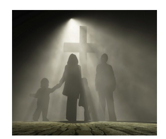
Take it Home! Sunday, March 22, 2020 12:00 pm

What would happen in your family if you regularly confessed how you have hurt each other, and practiced speaking clear words of forgiveness to each other? What would that mean for your children's understanding of God's forgiveness, and for their future relationships?