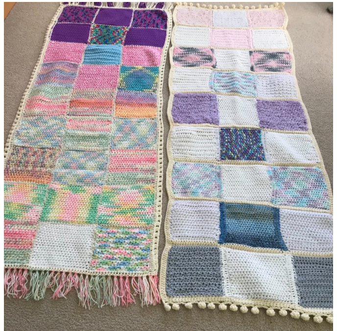
Prayer Shawls for Pregnancy Care Centre