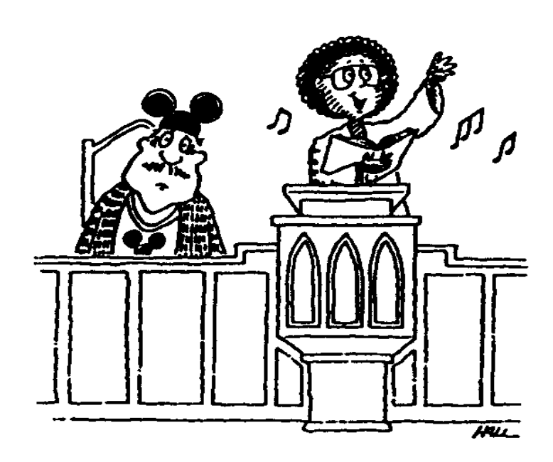
11:15 A.M.—PASTOR BYRD BEGINS TO SUSPECT THAT THE WILDLY CREATIVE SERMON HE DEVELOPED AT 4:00 THAT MORNING MIGHT NOT BE AS INSPIRED AS HE THOUGHT.

WE ALSO REMIND OUR MEMBERS to be cautious with keys, phones and personal property. Do not leave things in coat pockets out in the narthex. We do seek to be vigilant and encourage all our members to practice that same vigilance, but problems can occur. Your help is greatly appreciated.