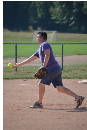
West Region Ball Tournament

We will also be planning for a Purdy's fundraiser around Christmas and a bottle drive shortly after Christmas, so watch for details about those events.